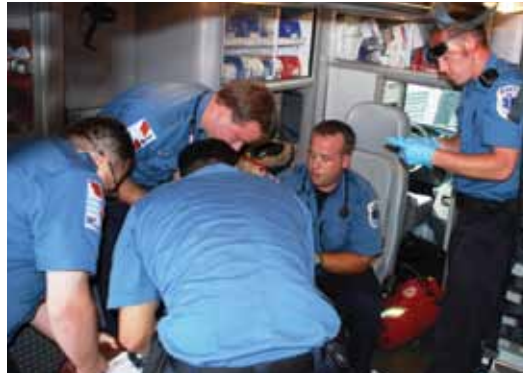
The JCMC EMS BLS and ALS crews work together as a team.

I had never been to Jersey City before, only passing by its freeway exits on my way to Newark airport. My images of this diverse city were much like those shown on the opening of the Sopranos as Tony Soprano drove across the bridges of New Jersey and