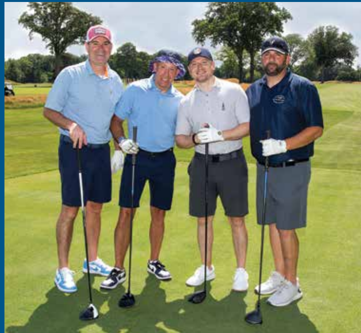
Fromkin Brothers Inc. foursome