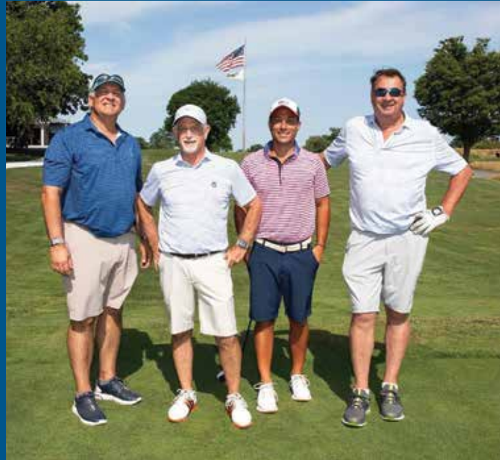
Torcon, Inc. foursome