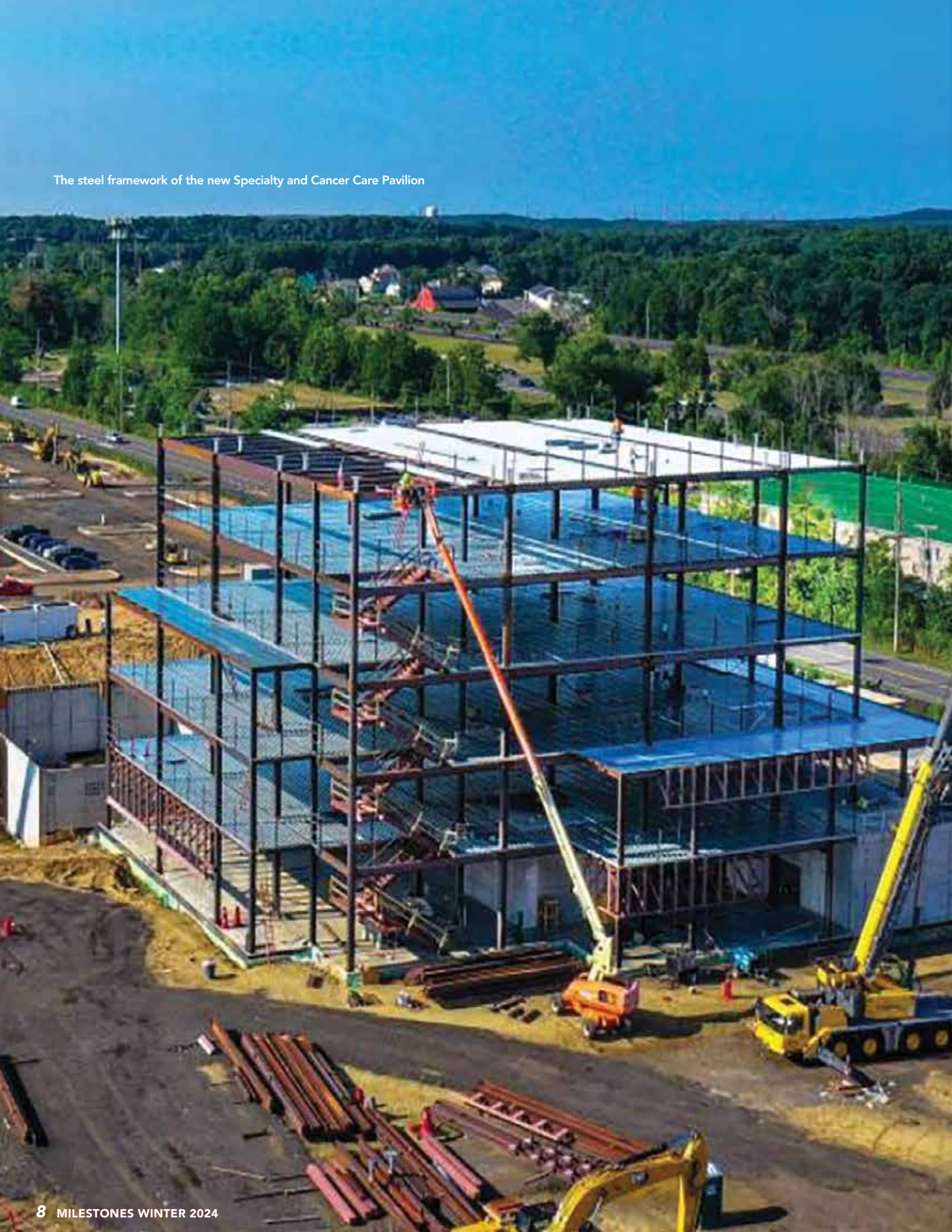
The steel framework of the new Specialty and Cancer Care Pavilion