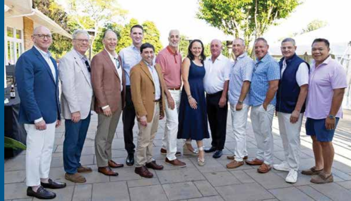
MMC leadership, guests and sponsors at the cocktail reception