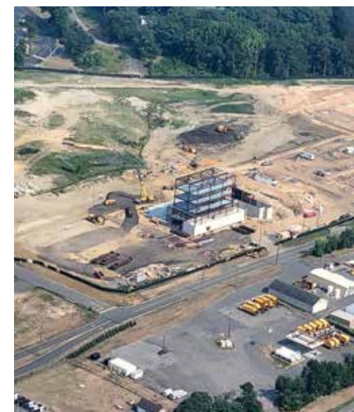
An aerial view of the 36-acre Vogel Medical Campus

The construction of the building's steel framework marks an exciting milestone in the project's development. The steel structure is now complete, with a total of 1,985 pieces—3,500 tons of steel—used throughout the construction process.