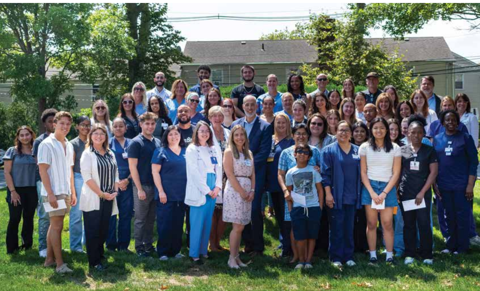
Celebrating the 2024 Employee Scholarship recipients

Every year, the Employee Campaign continues to grow, as employees of Monmouth Medical Center (MMC) show tremendous generosity to their fellow colleagues. This program offers employees the chance to give back to one another by contributing voluntary donations for our Employee Emergency Assistance Fund and Employee Scholarship Fund.