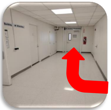
Go through the door to the N Building