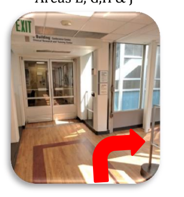
Make a right and zig-zag to N Building