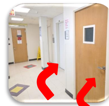
Go through the door and either take the stairs on right or elevator to 4<sup>th</sup> floor