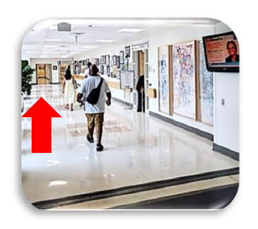
From the elevator or escalator, walk over the bridge.