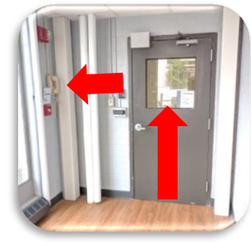
Once at door, pick up phone and call x42650 . If no one answers, call "0"