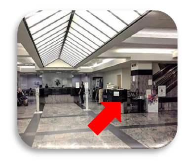
Check in with security and take the escalator or elevator to 2<sup>nd</sup> floor.