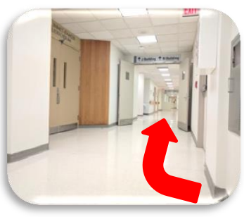
Once you get off the elevators, make a right towards "Vascular Access"