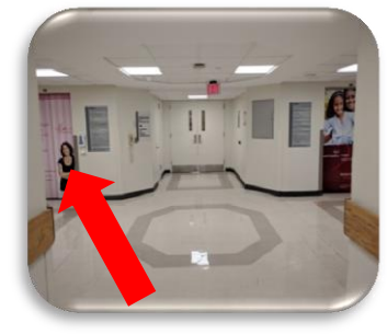
Once at the elevators, take them to the 3<sup>rd</sup> floor.