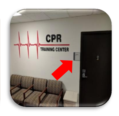
Most of the classes are held in Classroom A that is straight across from the elevators.