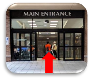
Enter through the main entrance.