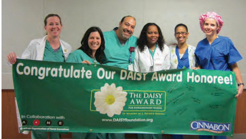
One of the first DAISY Award presentations at RWJBarnabas Health, in 2012, showcased how the honor uplifts relationships not only between nurses and patients but also between colleagues.