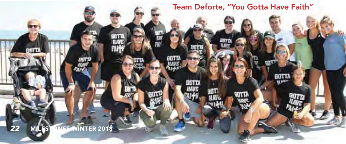
Team Deforte, "You Gotta Have Faith"

Big Steps for Little Feet teams and supporters have enabled Monmouth Medical Center to purchase state-of-the-art medical equipment to care for the region's smallest and most fragile babies. Big Steps for Little Feet continues to impact the care received at Monmouth Medical Center. Funds raised at the Walk generously support The Hirair and Anna Hovnanian Foundation Neonatal Intensive Care Unit at The Unterberg Children's Hospital at Monmouth Medical Center.