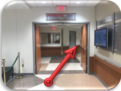
Go through doors around pillar