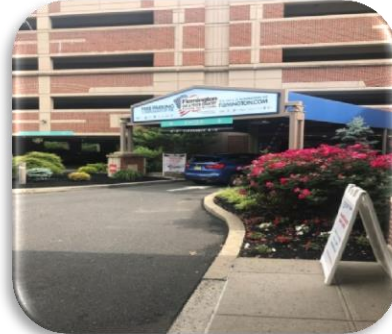
Park in Visitor Parking Lot