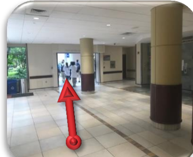
Walk through glass hallway