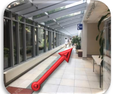
Continue all the way