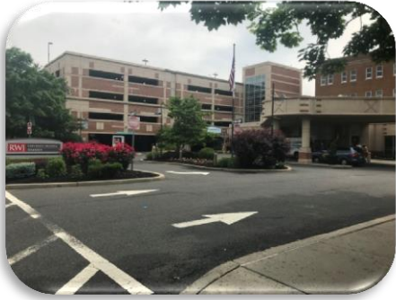
Enter at Rehill Ave to Main Entrance