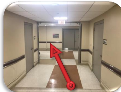
As you go through doors, make a right, left, and then right. (Zigzag)