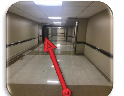
Training Room is down hallway on Left