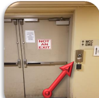
Go through Exit Only door. Press doorbell to be let in.