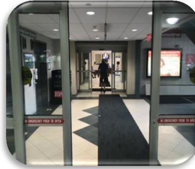
Enter through Main Entrance