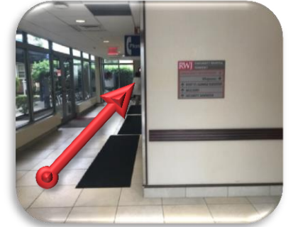
Go around corner and through door that is on your left.