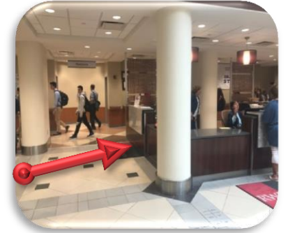
Check in with receptionist