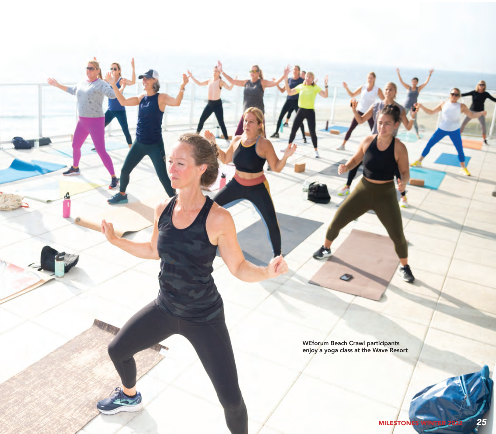
WEforum Beach Crawl participants enjoy a yoga class at the Wave Resort