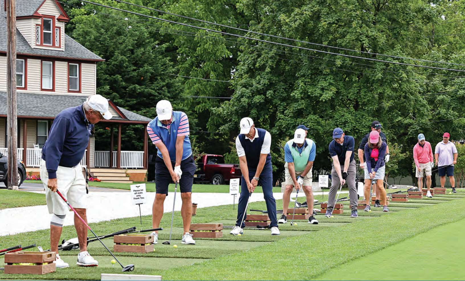
Golfers visit the driving range before play