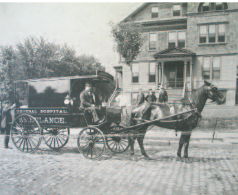
A horse-drawn ambulance is pictured in front of the Elizabeth General Hospital & Dispensary in this 1890’s photo.