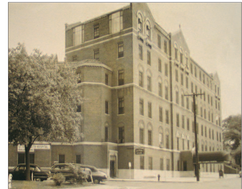
This 1950’s view of St. Elizabeth Hospital shows the old entrance on South Broad Street.

The caring work that was initiated long ago by Elizabeth General Medical Center, St. Elizabeth Hospital and Alexian Brothers Hospital is carried forward by Trinitas, which proudly offers high quality care and services through Centers of Excellence that include: Maternal/Child Health, Renal, Cardiac, Behavioral Health & Psychiatry, Senior Services, Women’s Services, Diabetes Management, The Trinitas Comprehensive Cancer Center, the Center for Wound Healing & Hyperbaric Medicine, the Sleep Disorders Center and the Trinitas School of Nursing.