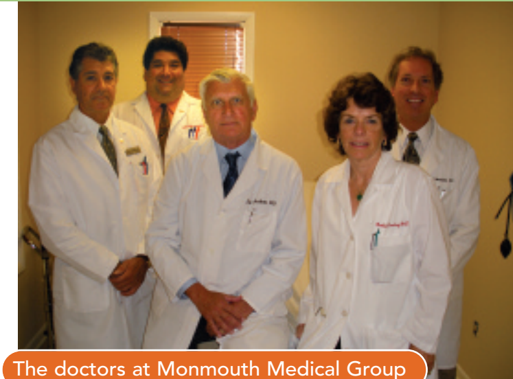
The doctors at Monmouth Medical Group

She tells of a woman who suffered such severe