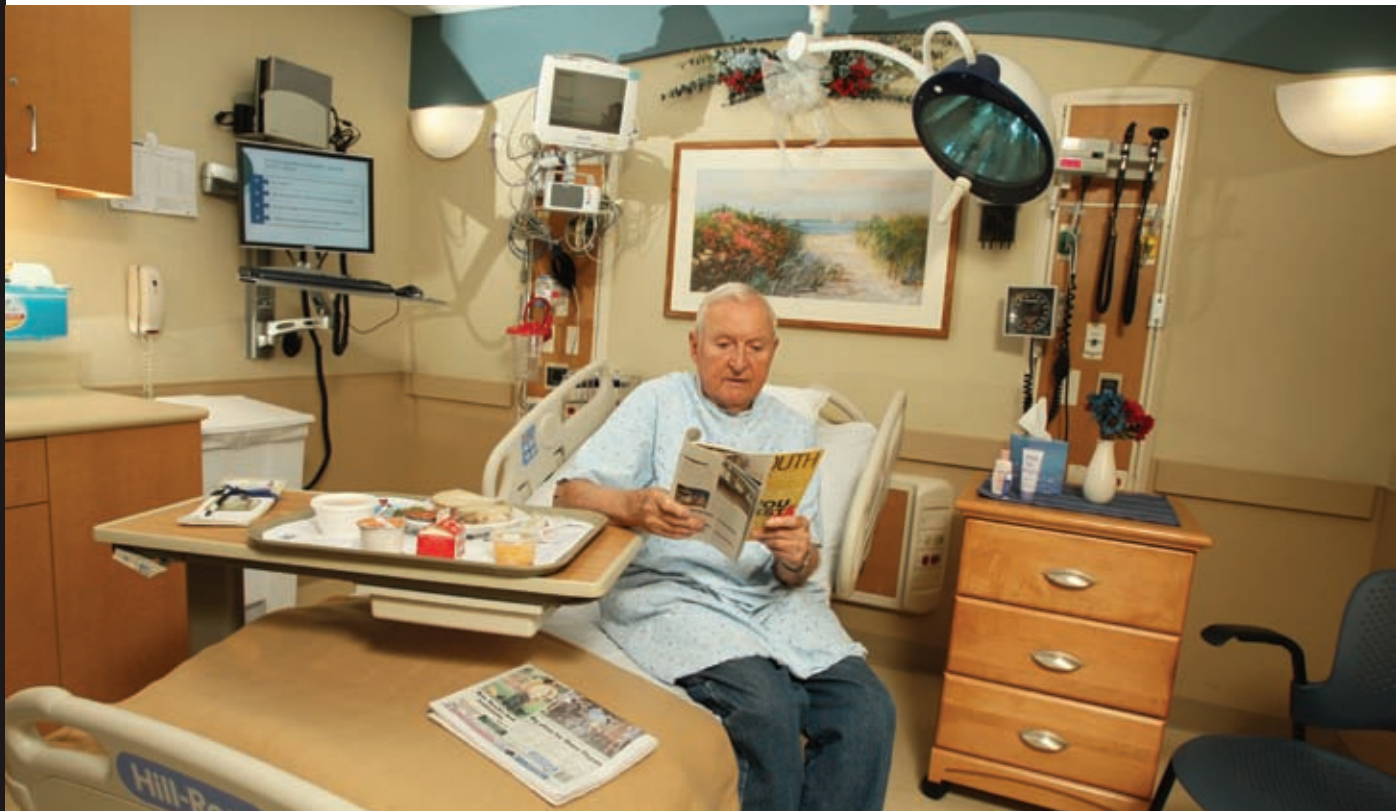
THE NEW GEM UNIT AT MONMOUTH MEDICAL CENTER FEATURES SIX PRIVATE ENCLOSED ROOMS ATTUNED TO SPECIAL AGE-RELATED NEEDS WITH WALL SCONCES THAT CAN BE DIMMED TO PROVIDE A MORE RELAXING ENVIRONMENT AND FLOOR LIGHTING THAT REFLECTS TO PREVENT FALLS.

CATERS TO SPECIAL NEEDS OF ELDERLY ER PATIENTS