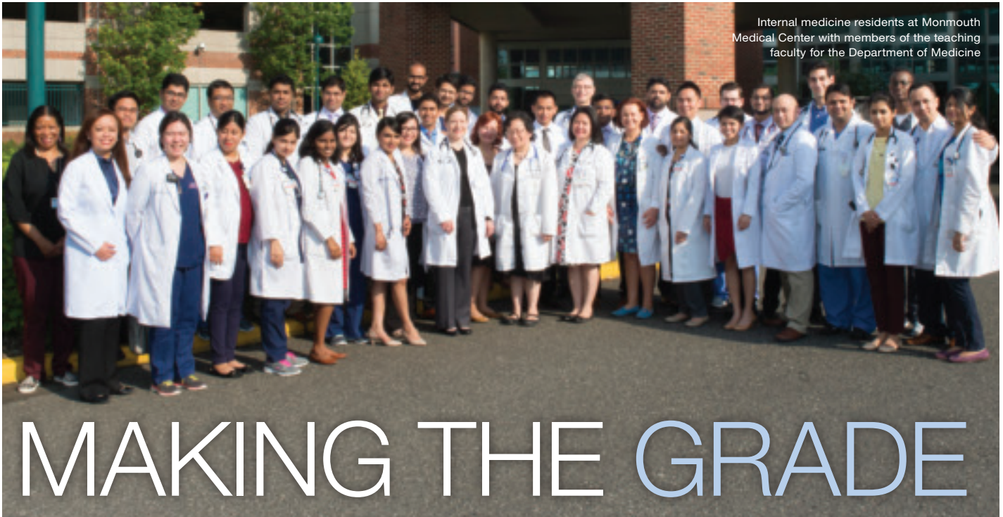
Internal medicine residents at Monmouth Medical Center with members of the teaching faculty for the Department of Medicine

MEDICINE + TECHNOLOGY + PATIENT CARE AT MONMOUTH MEDICAL CENTER