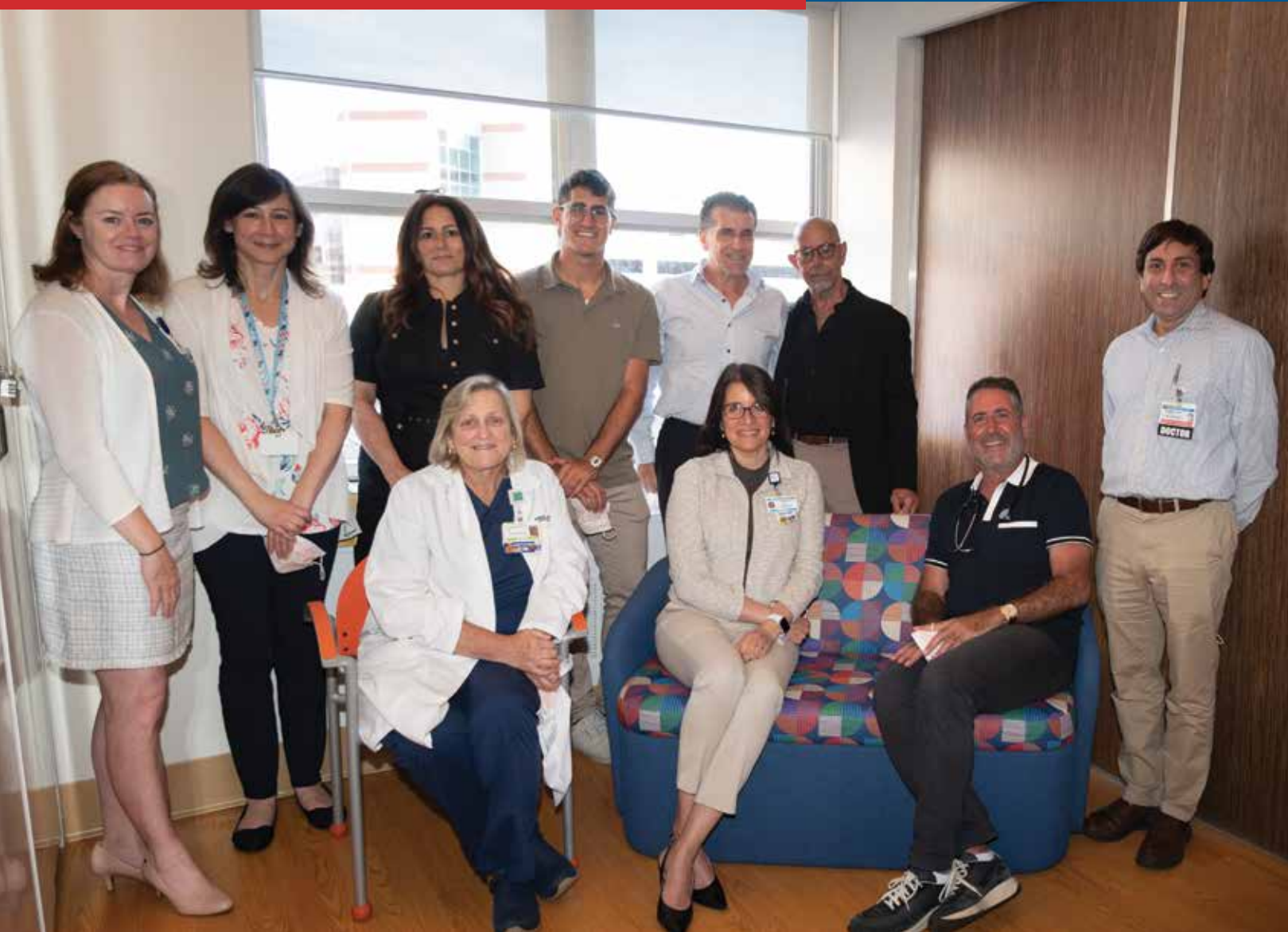
GATHERING IN THE EZRA ABRAHAM TO LIFE FOUNDATION LIVING ROOM:

To make a donation or to learn more about the ways you can be involved, please contact us at 732.923.6886 or go to monmouthgiving.org