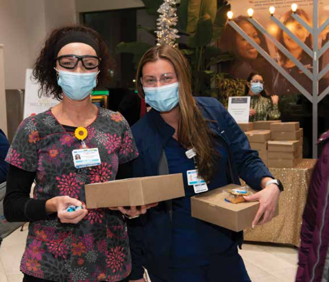
TOP PHOTO: Members of the MMC Frontline team pick up dinner and dessert to go