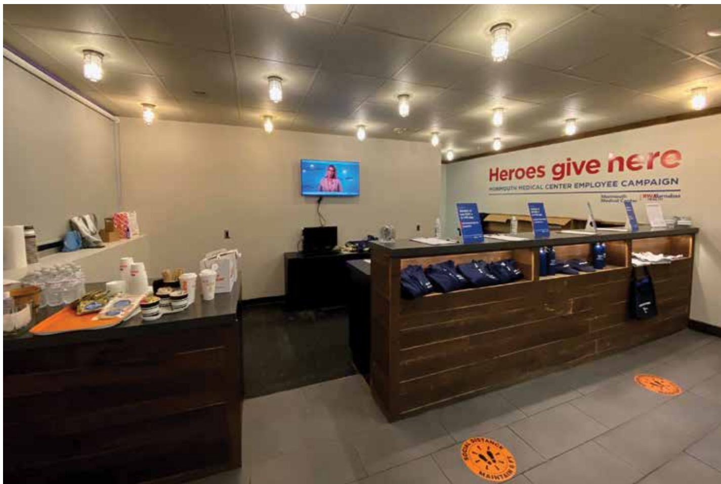
The Heroes Give Here Shop gifts employees with MMC swag when they give to the annual employee campaign