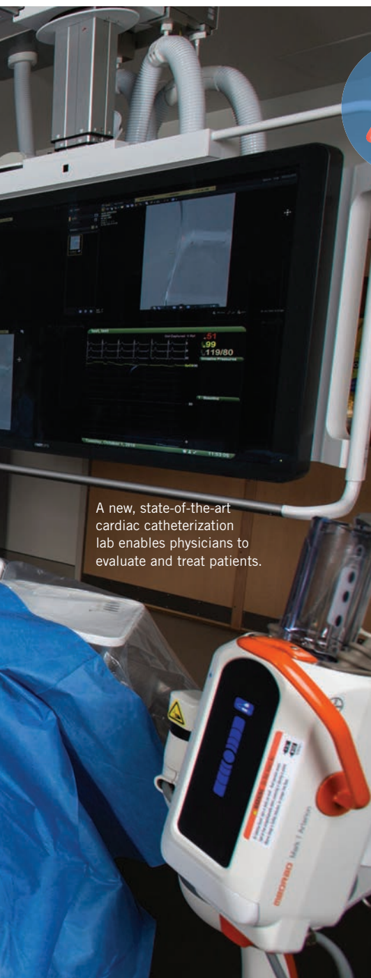
A new, state-of-the-art cardiac catheterization lab enables physicians to evaluate and treat patients.